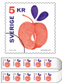
Coil stamp 10 stamps/ 1 motif Art nr: 243277 PRICE SEK 50

Apples are a popular fruit in Sweden and one of the commonest types of fruit trees grown. Arguably one of the best things about the fall is the apple harvest, when you can pick the fruit you've nurtured over the spring and summer. And, as the saying goes, "An apple a day keeps the doctor away." Apples are wonderful for apple sauce, apple cider, apple pie - and now for stamps too. Send a fall greeting to your friends and families embellished with beautiful and delicious apples.