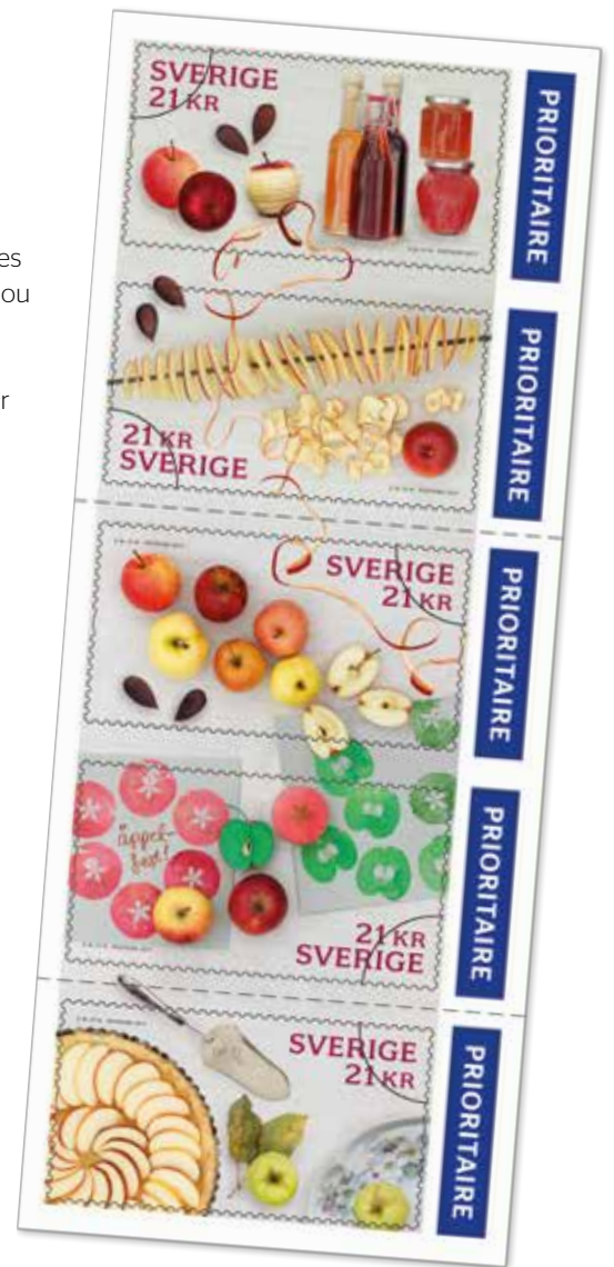
Booklet 5 stamps/5 motifs Art. no.: 243275 PRICE SEK 105